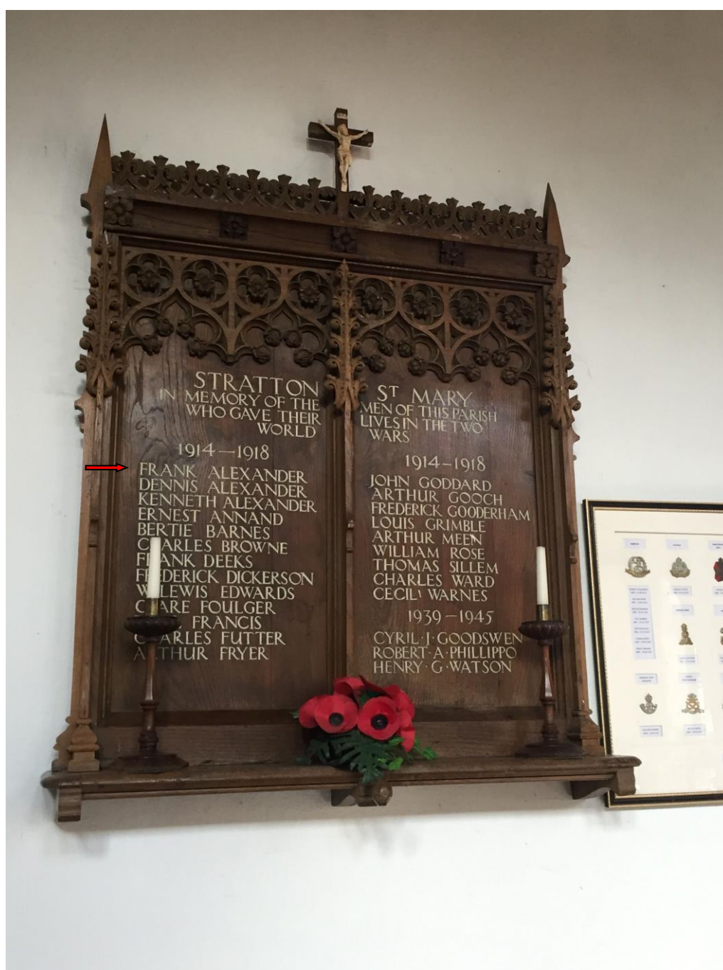
St. Mary’s Stratton Roll of Honour