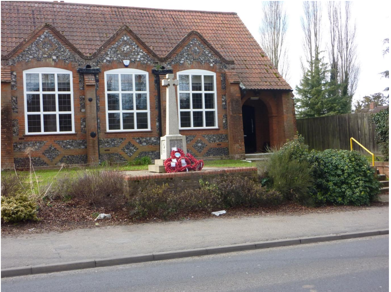
Long Stratton War Memorial