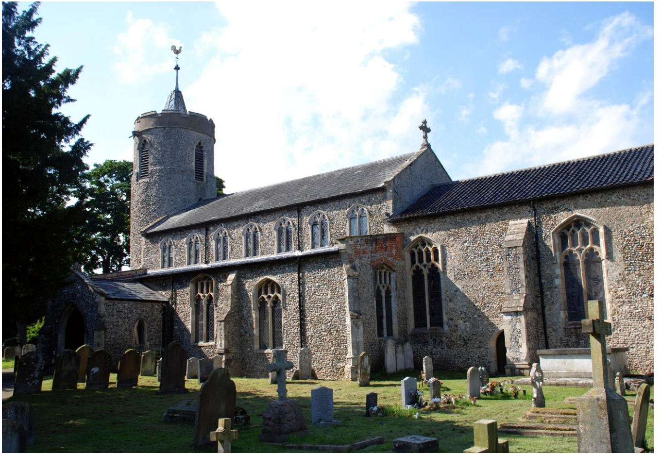
St Mary's Churchyard, Stratton